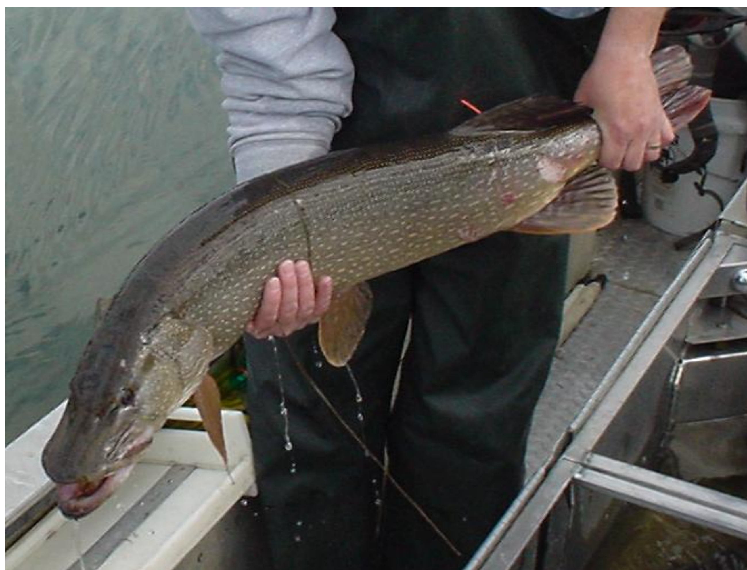
Northern pike collected electrofishing, tagged with a numbered Floy tag (circle), and being released at the location of capture. The proportion of tagged fish to untagged fish in a second random sample can be used to estimate the population size.

How: By using pike population data collected from Box Canyon Reservoir since 2004 and comparing that to the relative abundance indices (SPIN and Standard Warmwater Survey gill net CPUE's), we back-calculated the SPIN CPUE commensurate with conservation objectives for the southern half of the reservoir ( \leq 1.73 pike/net). Because habitat is less conducive for pike and risk of downstream movement into the Columbia River system is greater, the target CPUE for the northern half of the reservoir is < 0.5 pike/net.